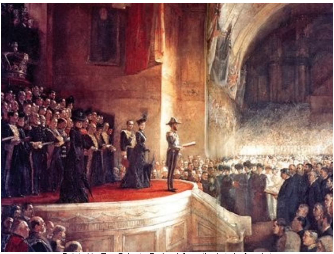
Painted by Tom Roberts. Further information is to be found at

http://www.peo.gov.au/students/cl/first.html