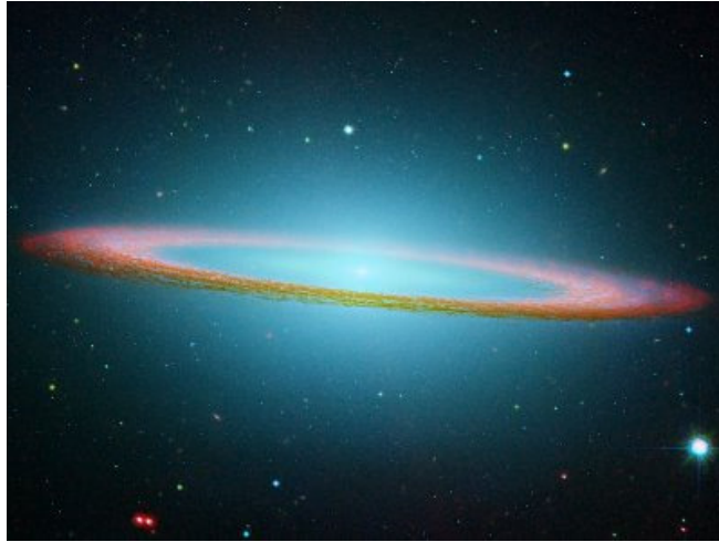
The glory of the Sombrero galaxy taken with an infrared camera

Actually, God's glory is mentioned so frequently in scripture that sometimes we tend to read over them. See for instance Is 40:5; Col 1:11; Heb 2:9; John 17:5,22 etc. It is associated with power, light, a shining appearance and pure holiness. What is "glory" anyway? In the English language it means a thing of beauty and magnificence, fame and honour as we have seen. As such that which is glorious deserves praise and rejoicing in. Similarly, in the Hebrew it means beauty, comeliness, honour, majesty, splendour, rich; while the Greek has the meaning of praiseworthy, dignity, honour, worship.