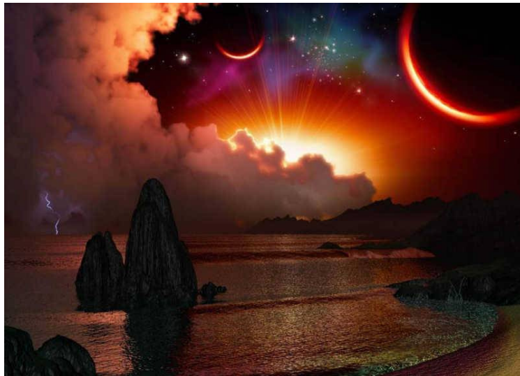
Darkness will give way to eternal light

For instance we find that in Genesis 41:8 Pharaoh dreamed in the night while Joseph was released in the morning (verse 14). The Heb here for morning is boqer which means “the breaking forth of light”, “dawn” or “daybreak”. In other words the Pharaoh was in darkness while Joseph was released from jail - like we will be freed of these frail human bodies in a resurrection. The final freedom, the final release from the imprisonment of this body and the final Jubilee which we will experience will be at the glory of the resurrection. And just as Joseph was given a new name (Gen 41:45) we will also be given a new name in the resurrection (Rev 3:12; Is 62:15). One day, probably on the Day of Trumpets, in the morning, we shall experience resurrection to new life and be given a new name.