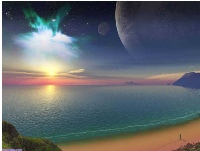
A wonderful, beautiful future awaits you

In turn, as we are called to glory and partakers of the very divine nature of God Himself (II Pet 1:3-4), Christians must develop holy, righteous character by the inculcation of the Laws of God, beatitudes and the fruits of the spirit (Rom 8:29; 1 Cor 15:49-50; Col 3:10) and become holy, pure in heart (Prov 23:7) just like God, but in miniature form: