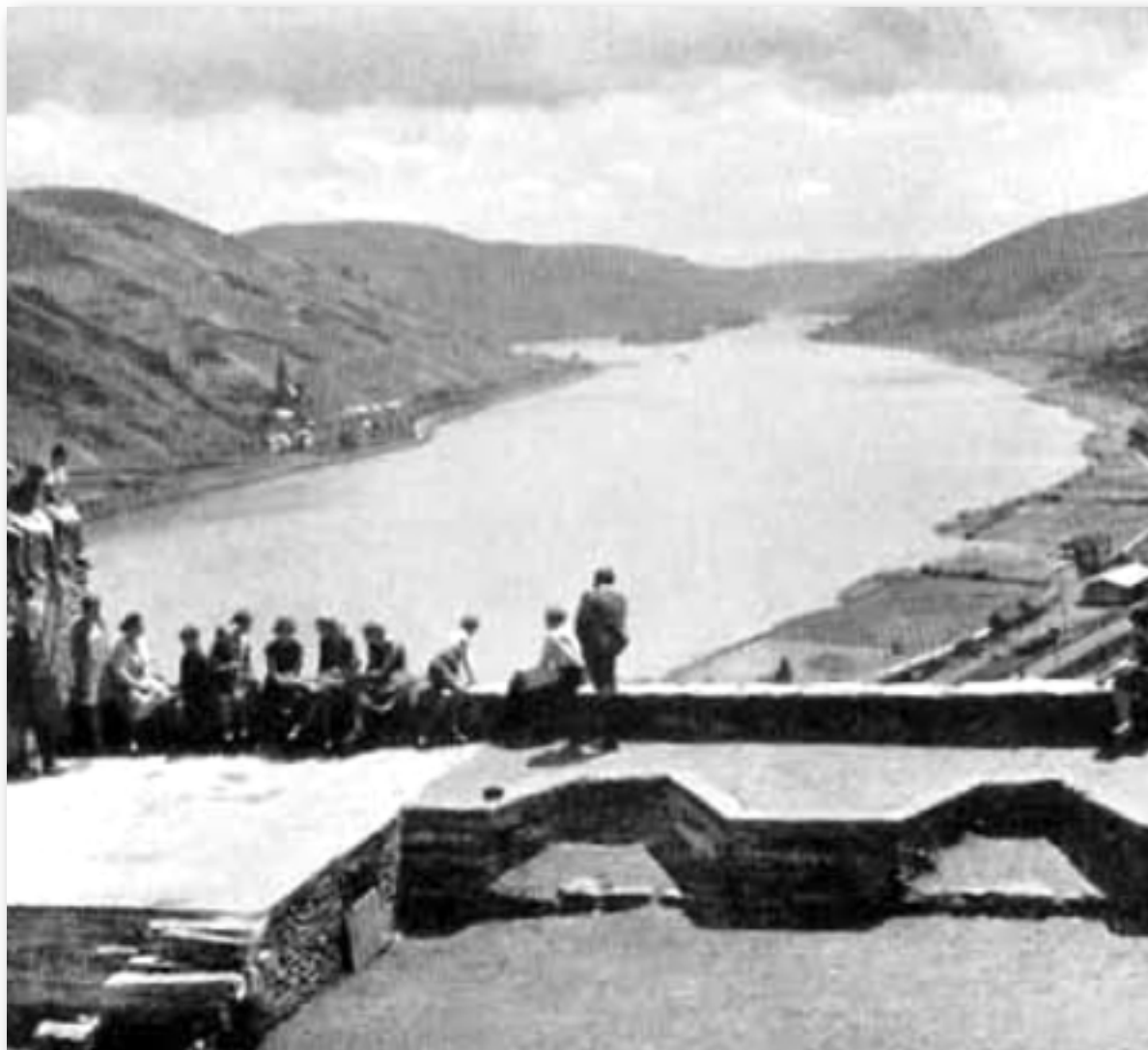
Youth Hostel Castle Stahleck near Bacharach in the Rhineland

They reckon on self-help. There are no porters, chambermaids or waiters. Everyone must look after his own wants and see that the shelter is left in good order for the next comers. The Jugendherbergen are simple, but the hygienic arrangements are modern and meet all requirements. This is especially true of those built within the last years by the various sections of the National League, by great societies or