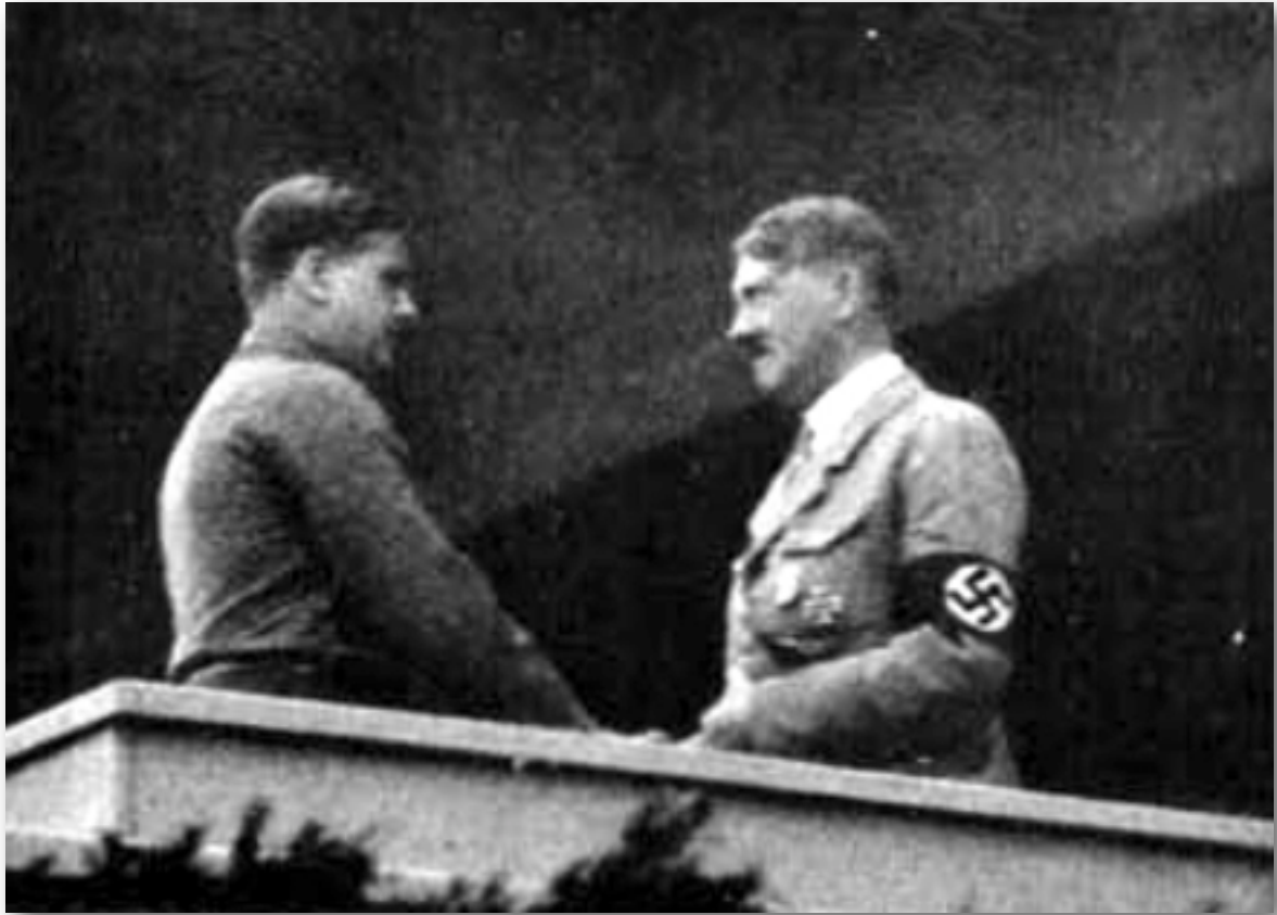
Baldur von Schirach and Adolf Hitler