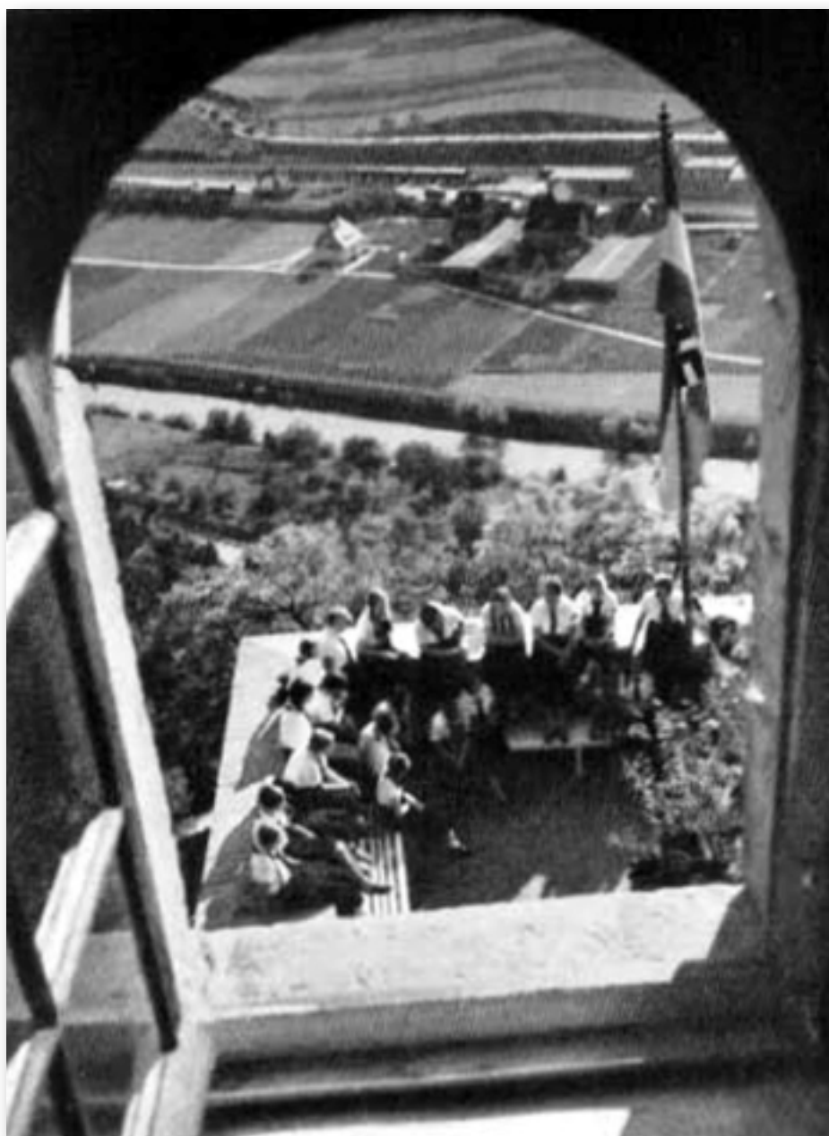
IN THE GIRL'S LEADER SCHOOL CASTLE NEUENBURG