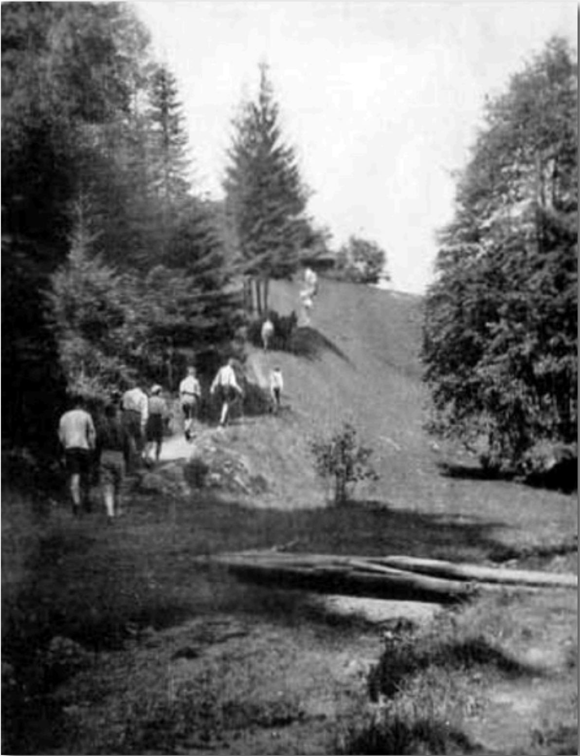
YOUTH ON THE TRAMP