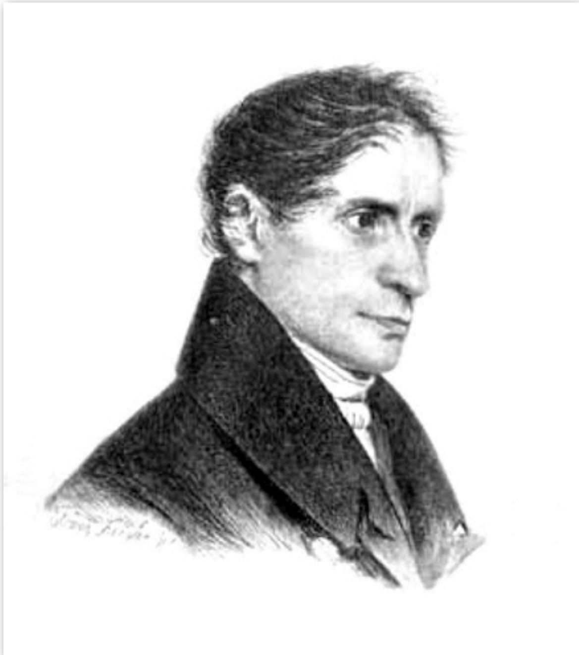
JOSEPH VON EICHENDORFF

“For our youth there is no ease of carefree play, no blithe immunity; the quest of life engages it early. We come to birth in the midst of struggle and in the midst of struggle, vanquished or victorious, we decline.”