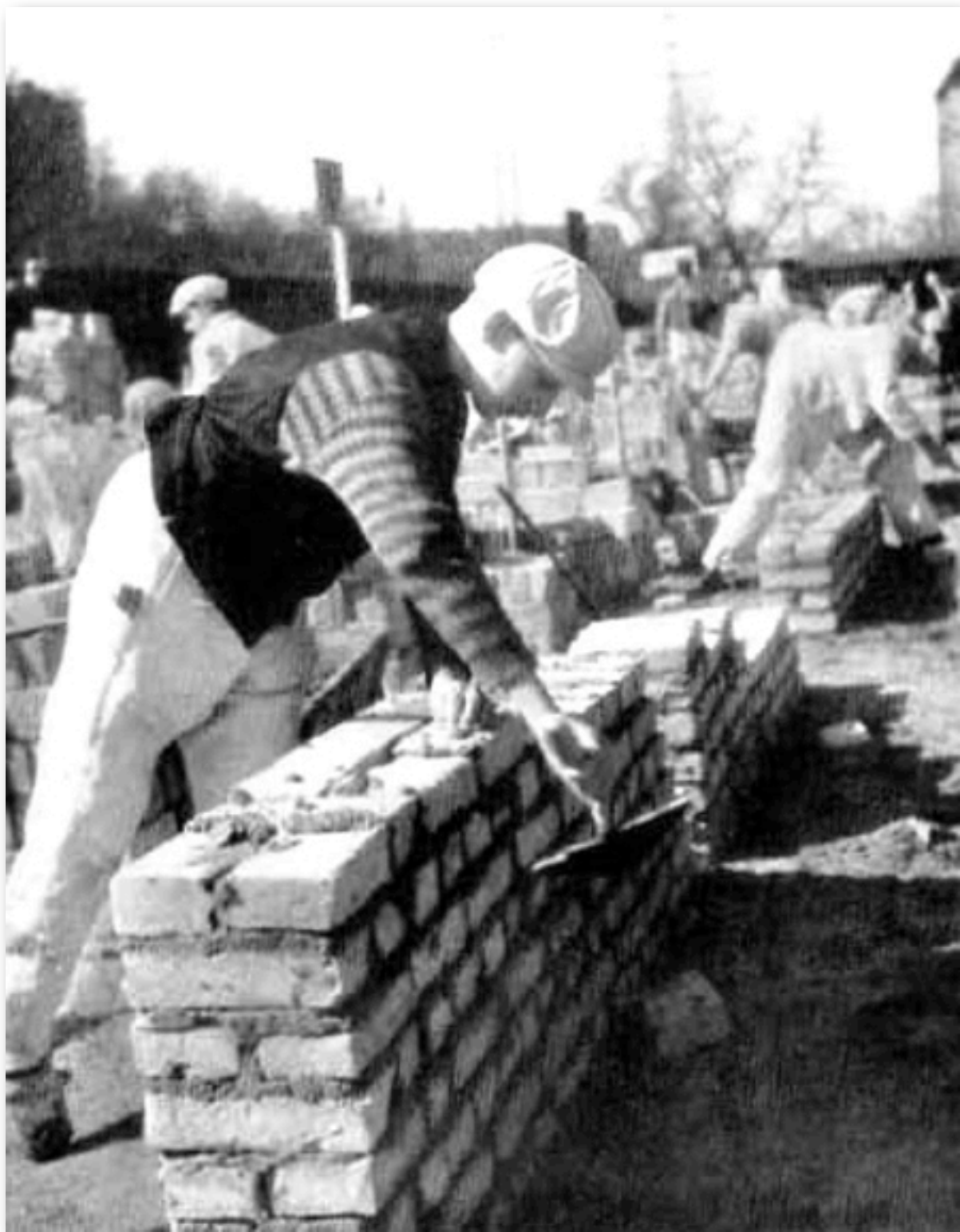
ONE OF A MILLION IN THE COMPETITION 1935