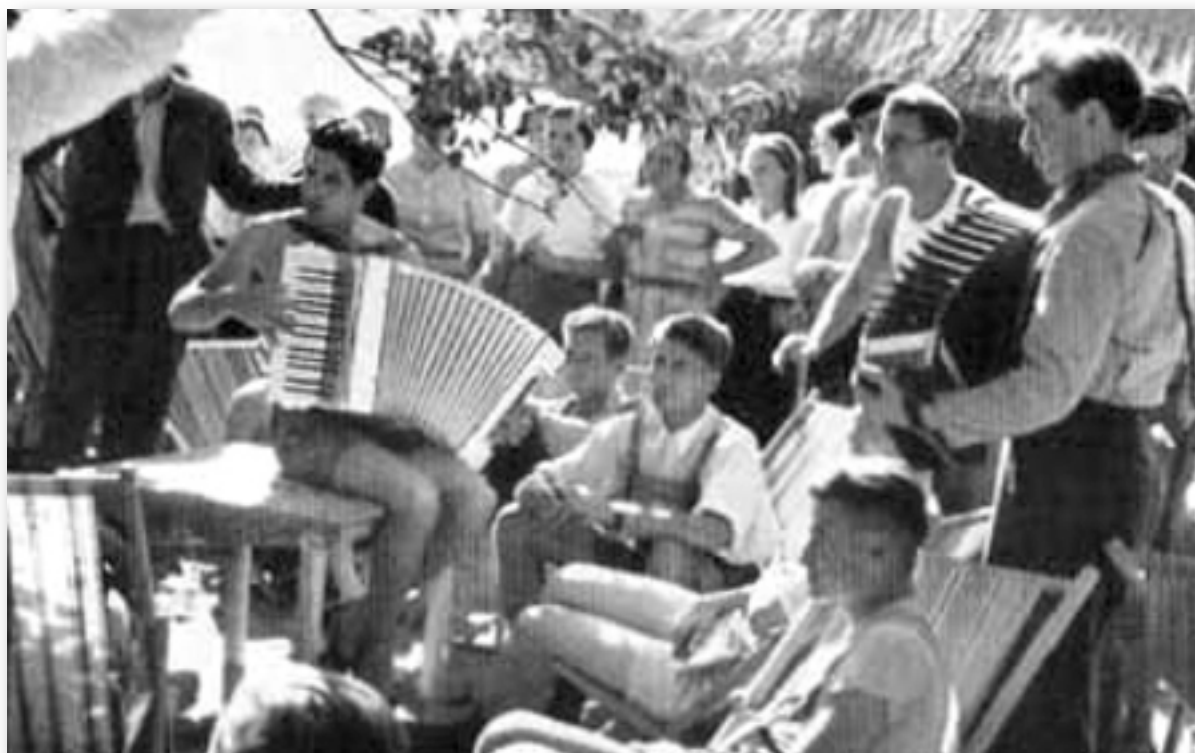
Foreign and German Students in Summer Camp on the Baltic shore

And for the future it will continue to be the goal which the youth leaders must persistently keep in view throughout all their international collaboration. This, for instance, was the spirit in which a camp for German youth was organised in England in the summer of 1935, as the counterpart of the English camps which were arranged in Germany the previous year.