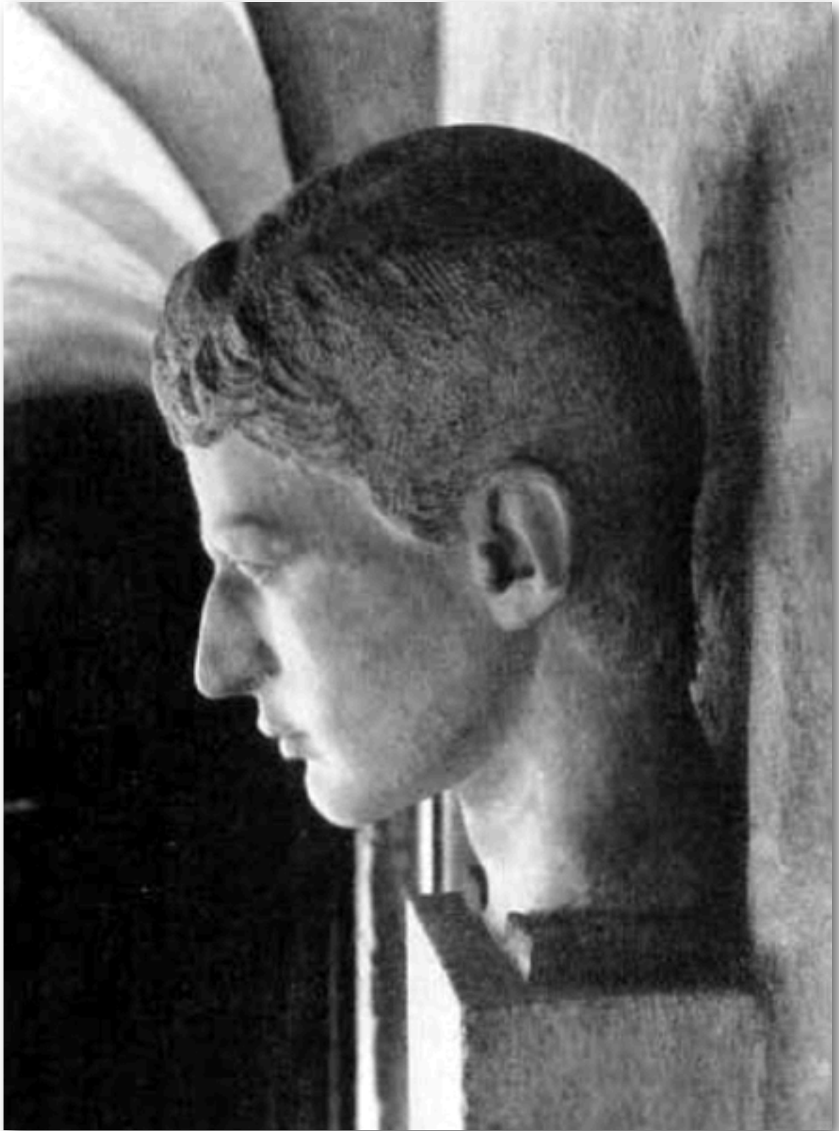
IN MEMORY OF GERMAN YOUTHS KILLED IN ACTION 1914-1918