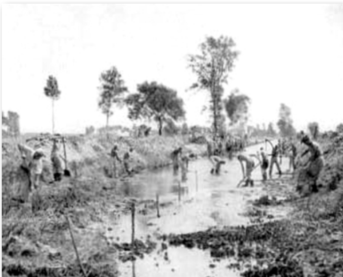
Drainage work in a flooded district