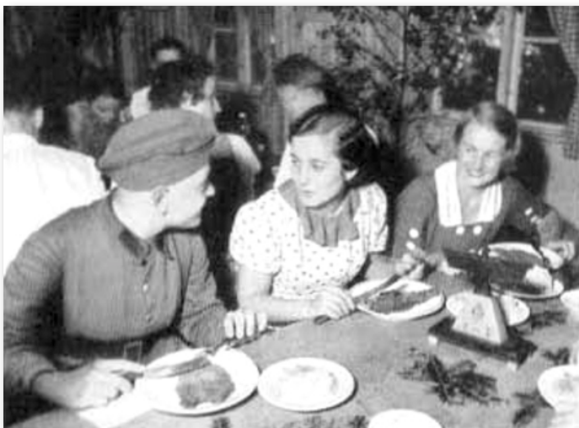
Foreign Students of Munich University visiting a labour service camp nearby