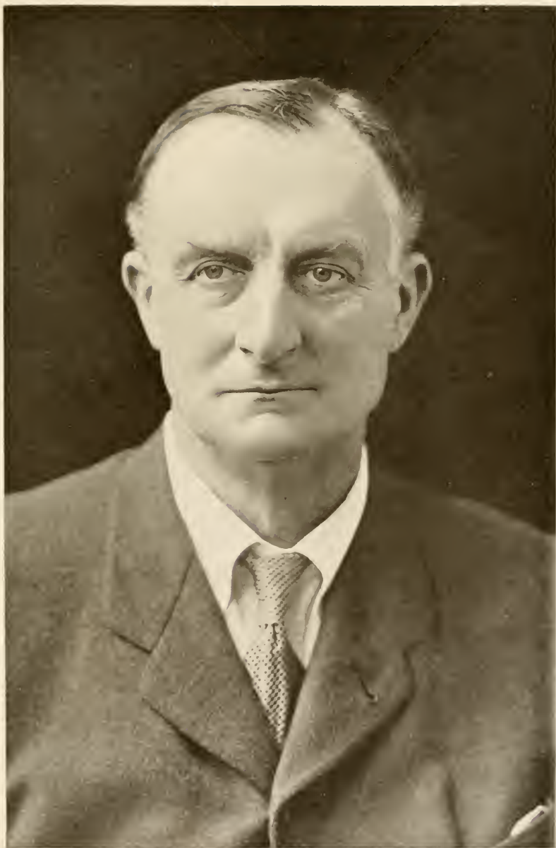
Viscount Grey of Fallodon