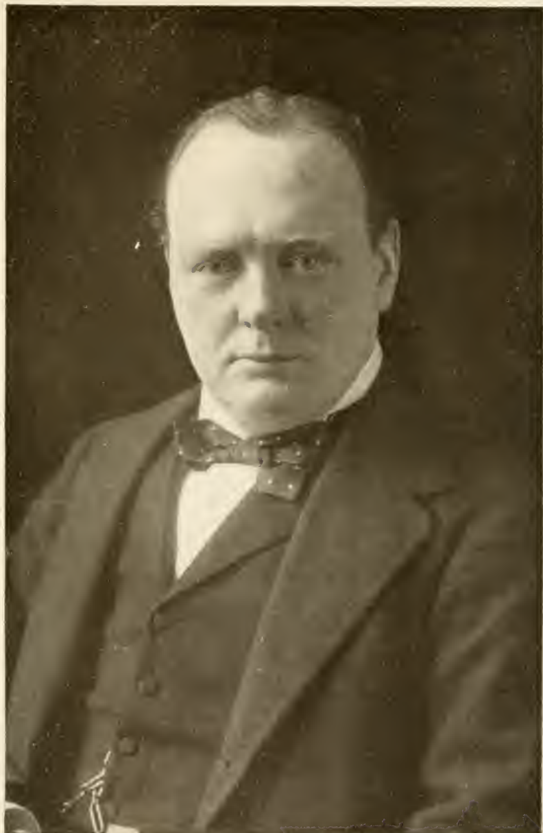
Rt. Hon. Winston Churchill