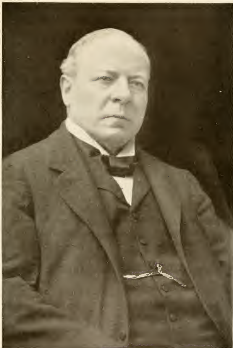
Viscount Haldane of Cloan