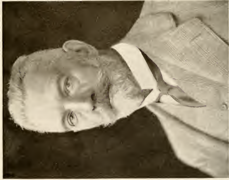
Dr. von Bethmann-Hollweg