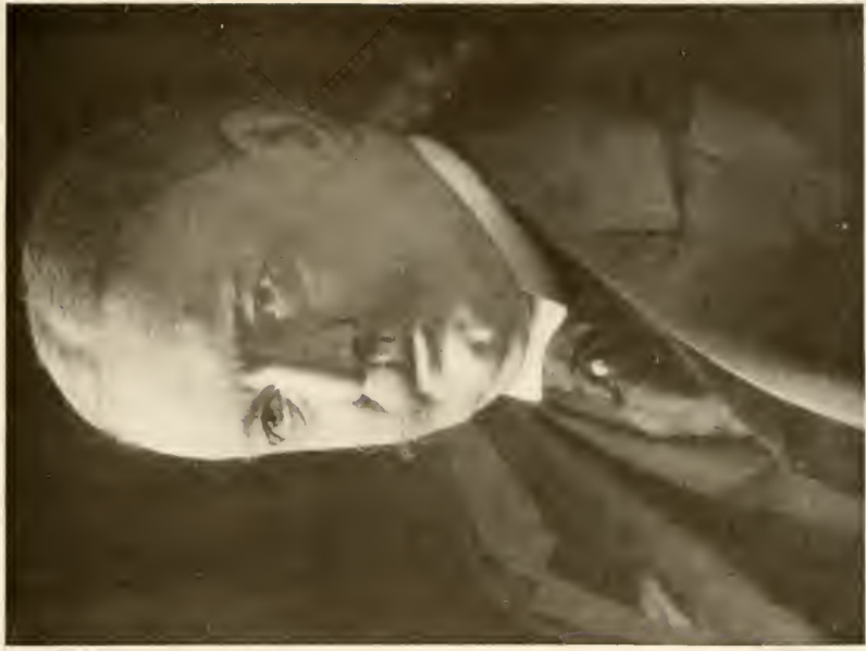
Prince von Bülow